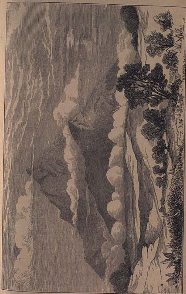
LITTLE CAMAROONS, FROM BLACK CRATER.