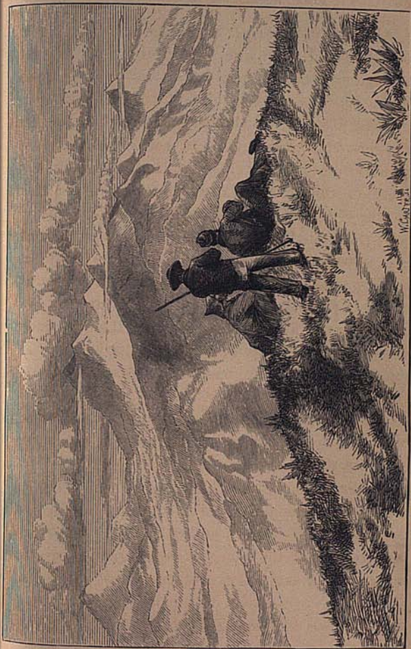
VIEW FROM THE TOP OF MOUNT HELICON.

their tranquil tone, when the naked eye one had, like Etna, distance presented the right was named to the left, Albert ignorant of the days before had arning. The deep Grande, compared